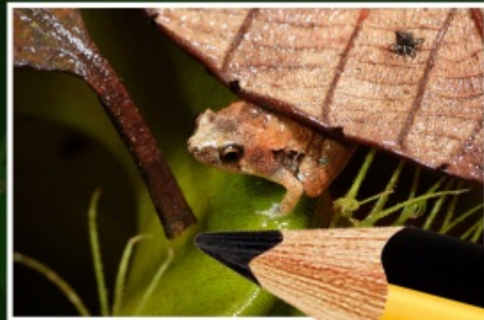
Microhyla nepenthicola , world's second smallest frog size not larger than a pencil tip; 10-13mm.

Kubah's 50-plus anuran species include some of the most unusual on the planet. Froggers will need to be very sharp-eyed to spot the perfectly camouflaged Bornean horned frog, Megophrys nasuta , while the tiny Microhyla nepenthicola , the world's second smallest frog, is easier heard than seen thanks to a croak out of all proportion to its size. The Kubah Frogging will push your detective ability to its limits as you spend two days rushing around the forest to see who can record the greatest number of species.