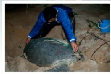
Measuring and tagging sea turtles