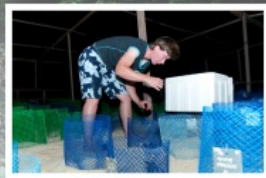
Collecting hatchlings for releasing

The package includes basic hostel accommodation and all meals while on the island. It does not include air fares, ground transportation, accommodation and meals on the mainland, insurance or travel agent's ground handling fees.